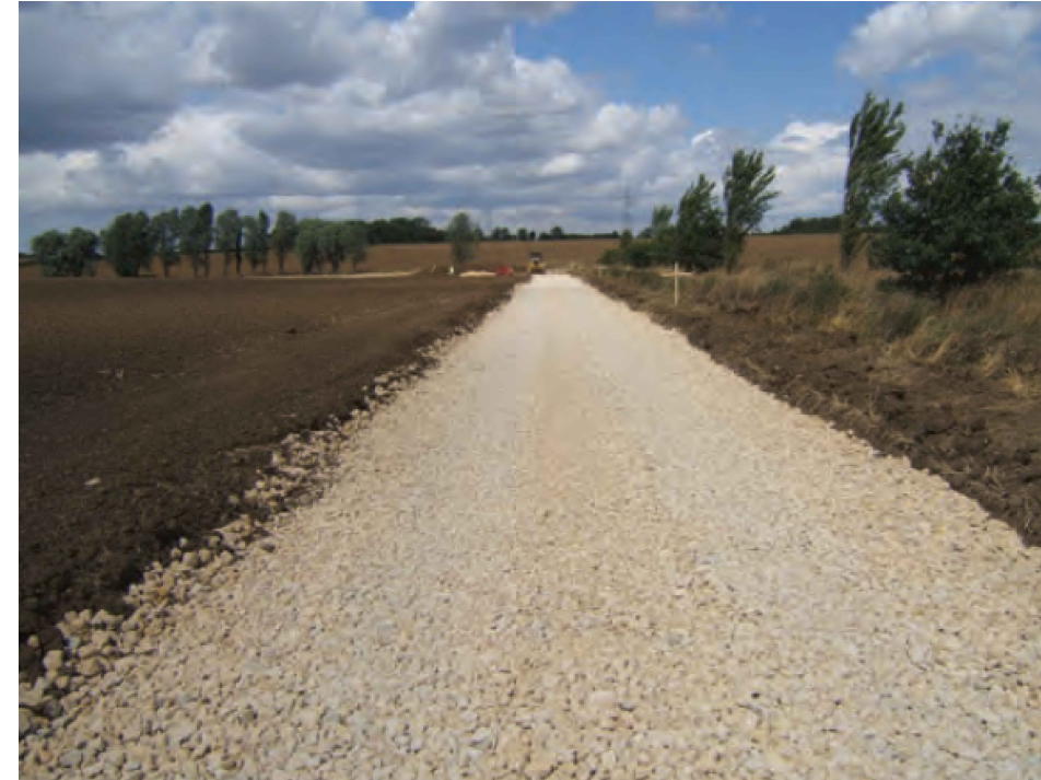
Typical Access Track