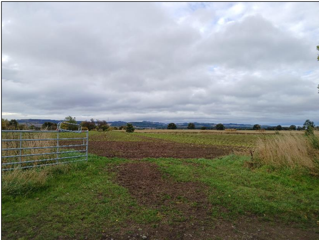
Plate 18: South facing view from field adjacent to North Mains of Ballindarg (Asset 46)