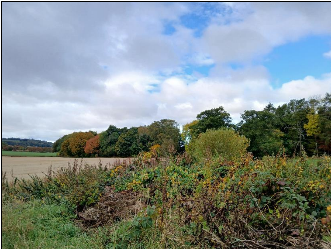
Plate 26: West-north-west facing view of moated site (Asset 5)