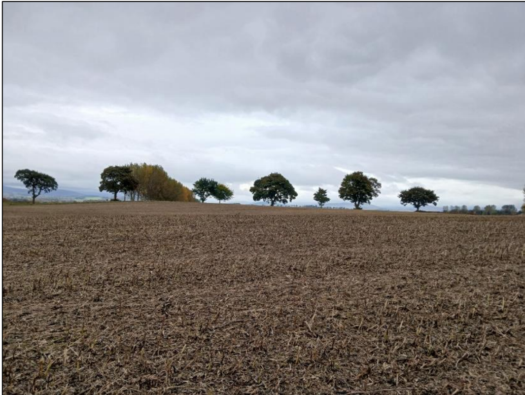
Plate 9: North facing view of the western field in Land Parcel 2