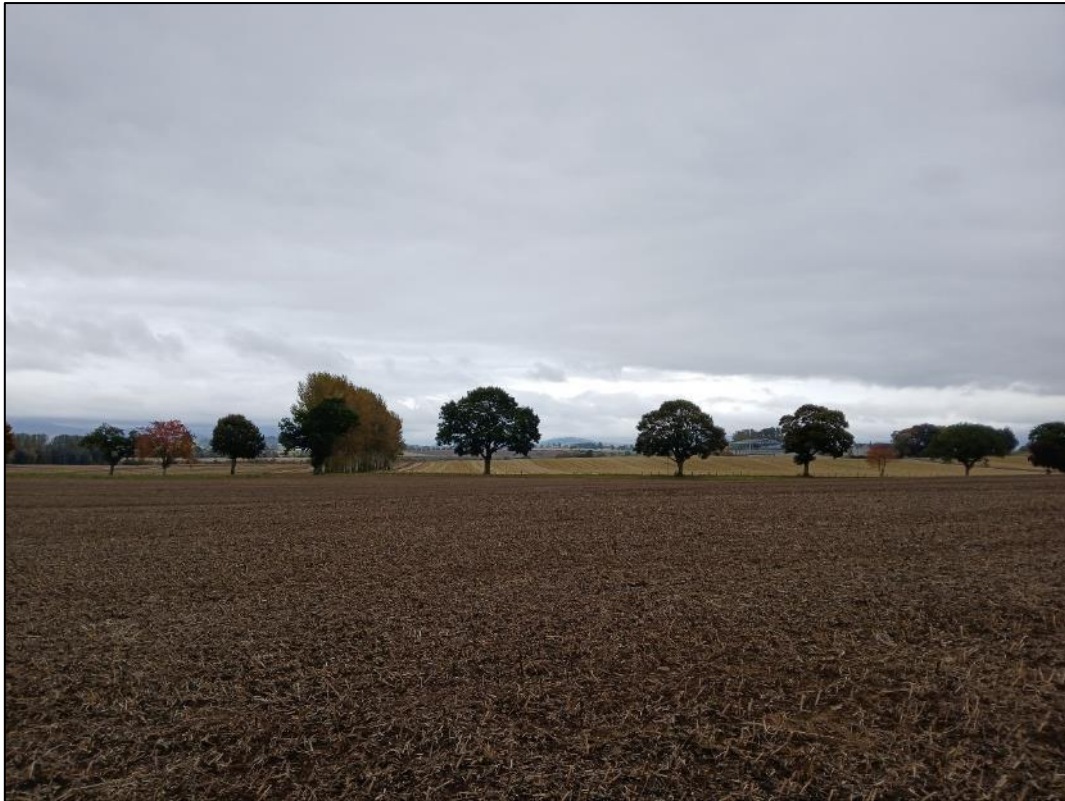
Plate 11: North facing view from the south edge of the eastern field of Land Parcel 2