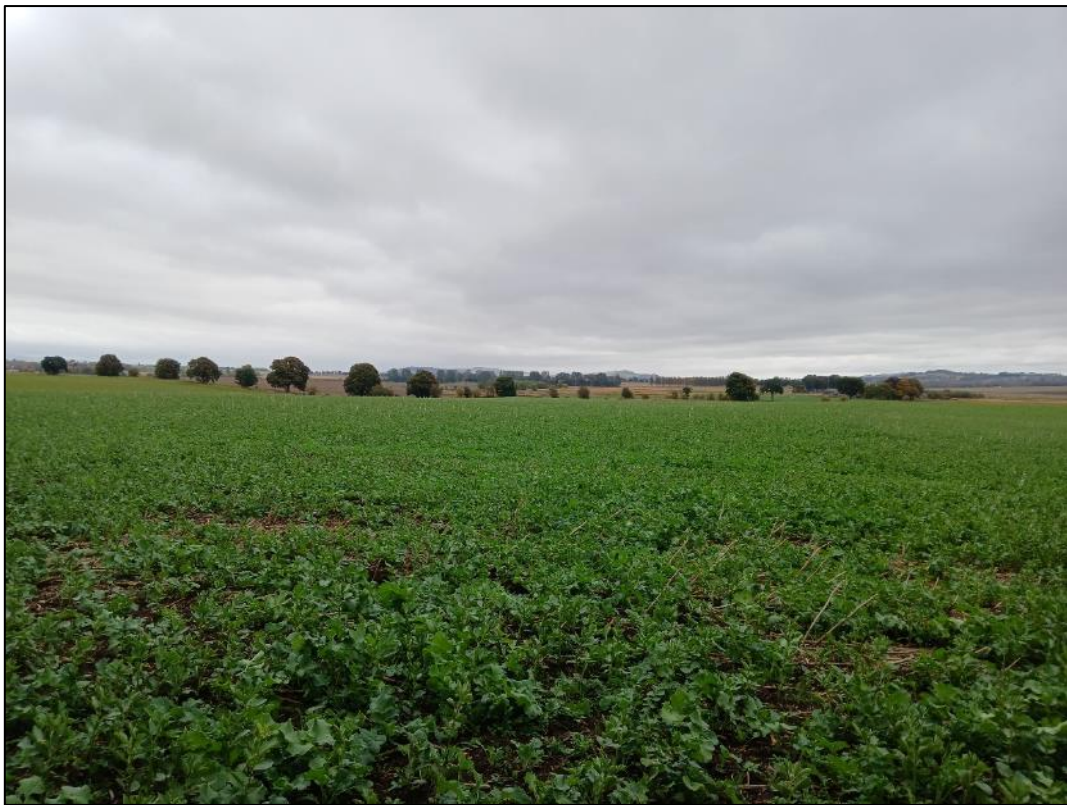
Plate 4: East facing view from the western edge of the western field of Land Parcel 1