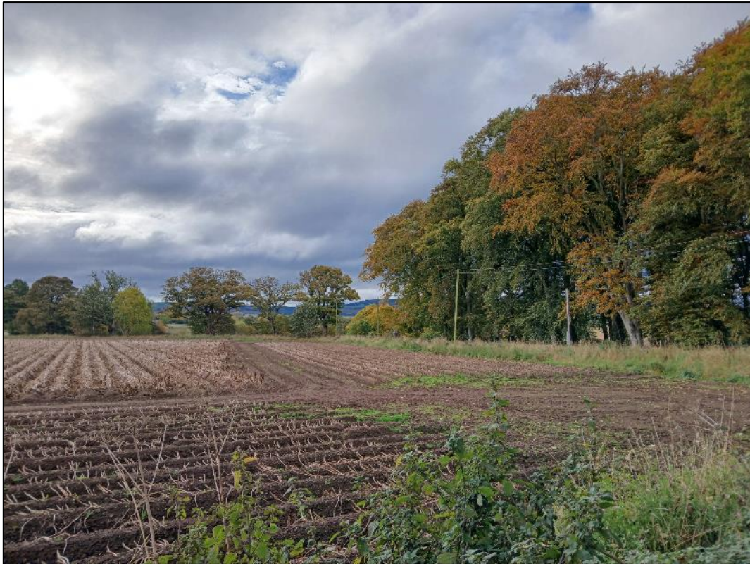
Plate 19: South facing view from a field adjacent to enclosure 100m southeast of Fletcherfield (Asset 9) looking towards the Site