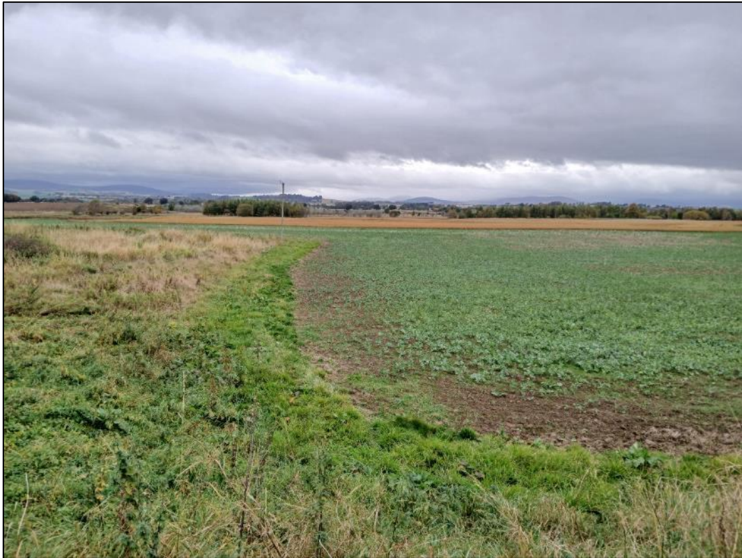
Plate 5: North facing view of Land Parcel 1 from its eastern field