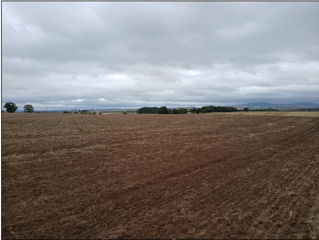
Plate 31: North facing view from St Orland's Stone (Asset 2)