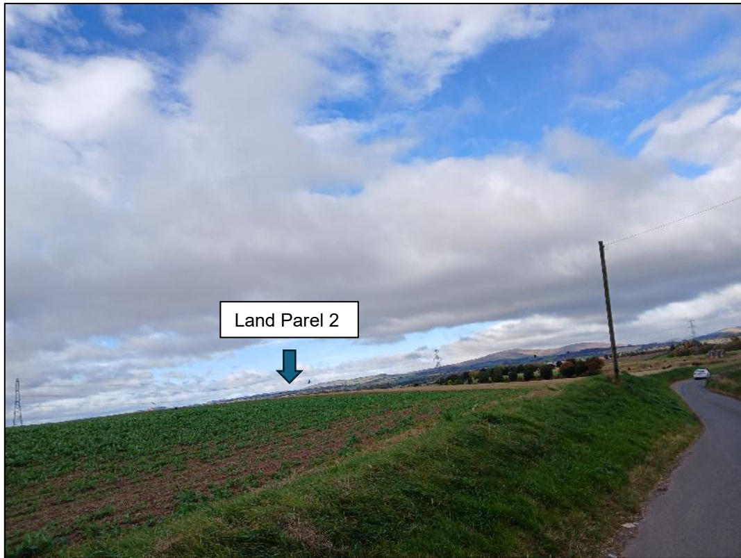
Plate 23: Northwest facing view looking towards the Site from North Leckaway (Asset 69 and 120)