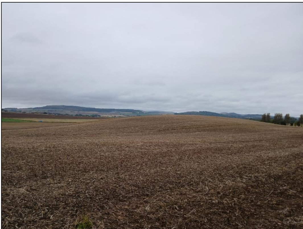
Plate 12: West facing view from eastern edge of east field in Land Parcel 2