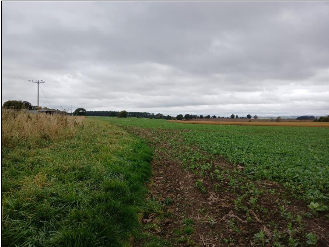
Plate 1: West facing view of the eastern field of Land Parcel 1