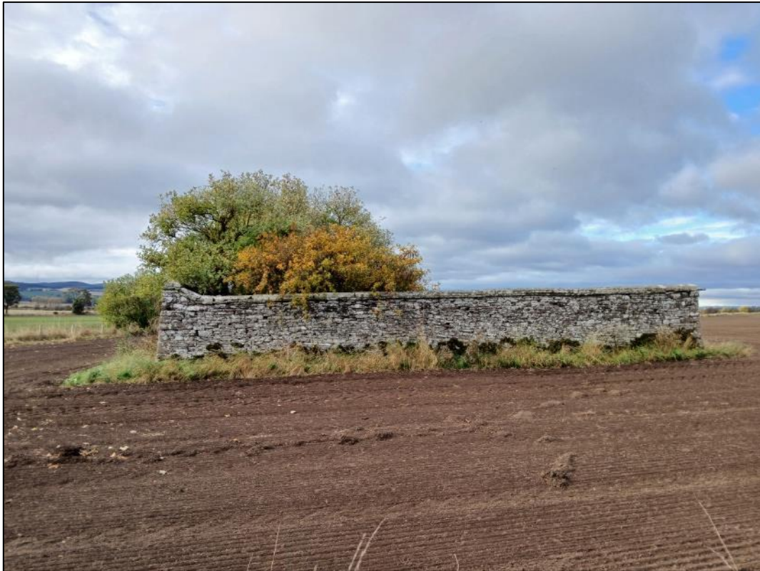
Plate 21: Southeast facing view from St Ninian's Chapel (Asset 48)