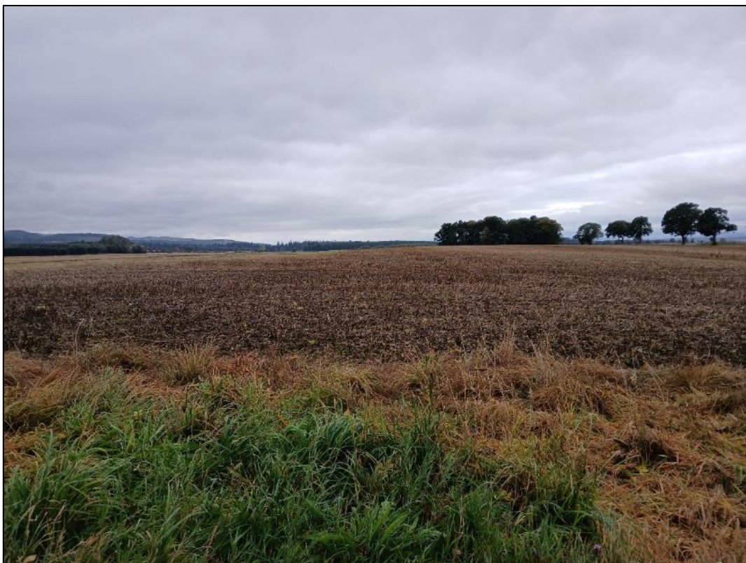
Plate 8: West facing view of the western field in Land Parcel 2