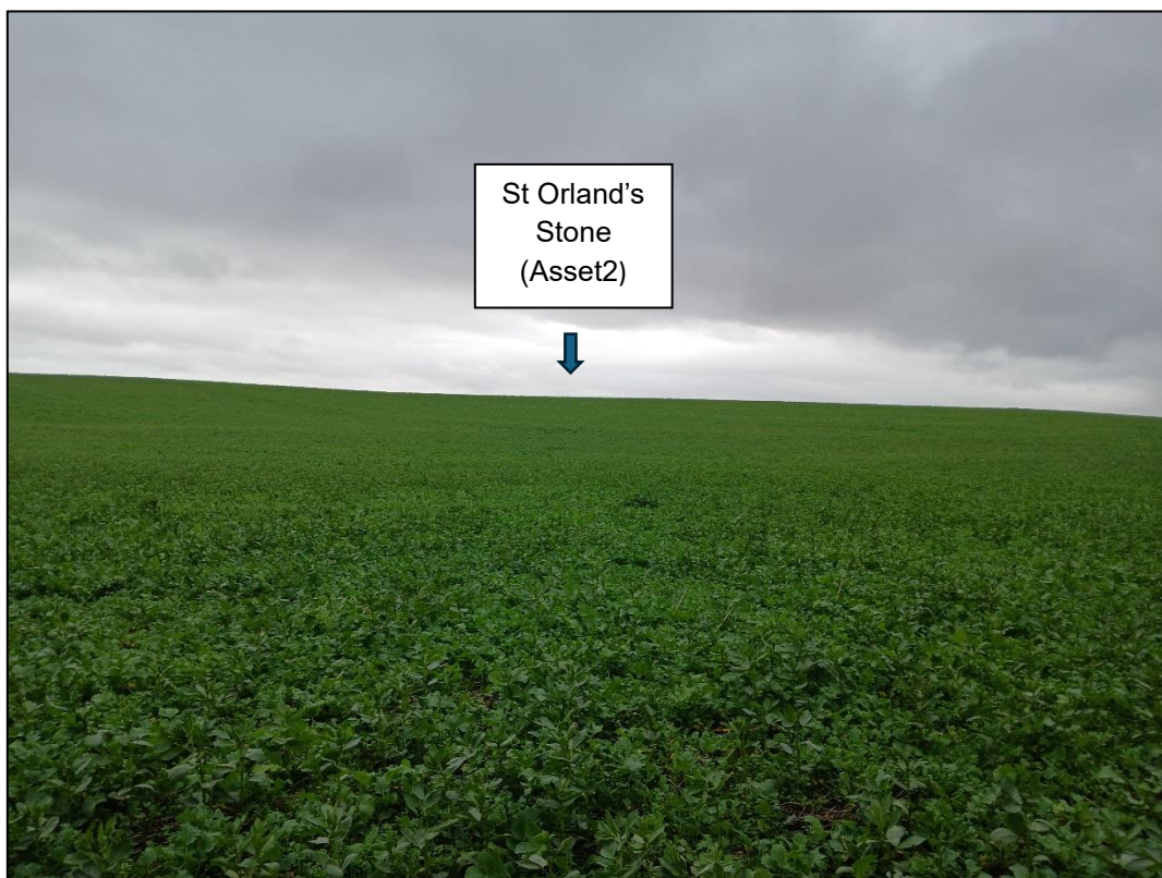
Plate 30: Northeast facing view from southwestern edge Land Parcel 1 adjacent to Gladis Castle GDL (Asset 16)