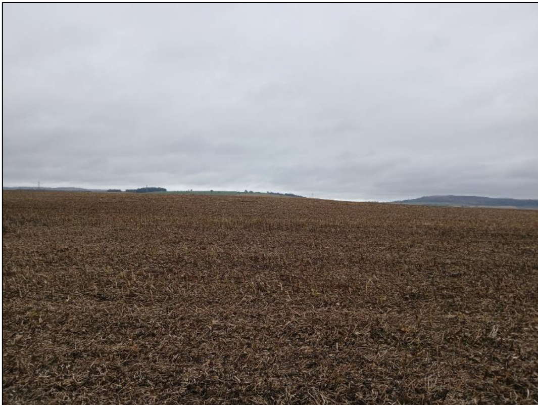
Plate 10: South facing view from from northern edge of the eastern field of Land Parcel 2