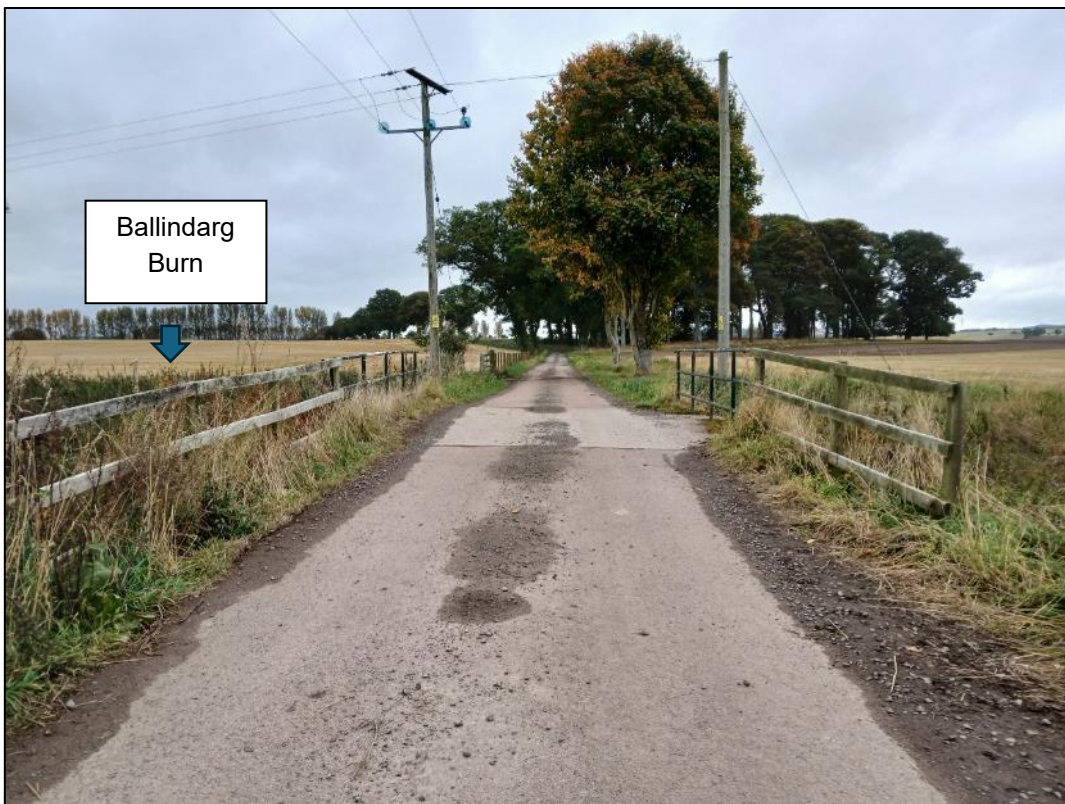
Plate 6: East facing view of the Proposed Cable Route