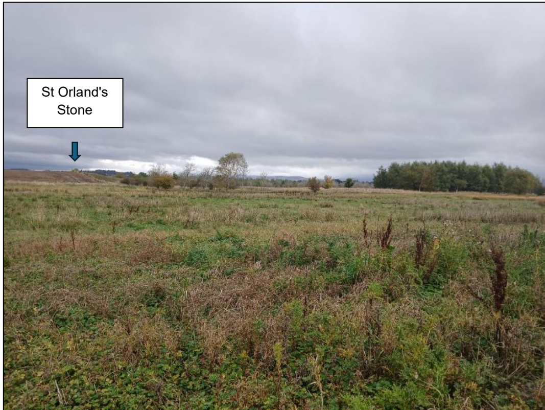
Plate 3: North facing view from northern edge of Land Parcel 2 showing location of St Orland's Stone (Asset 2)