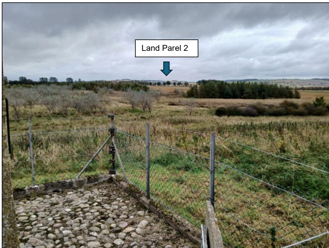
Plate 16: Southeast facing view from St Orland's Stone (Asset 2)