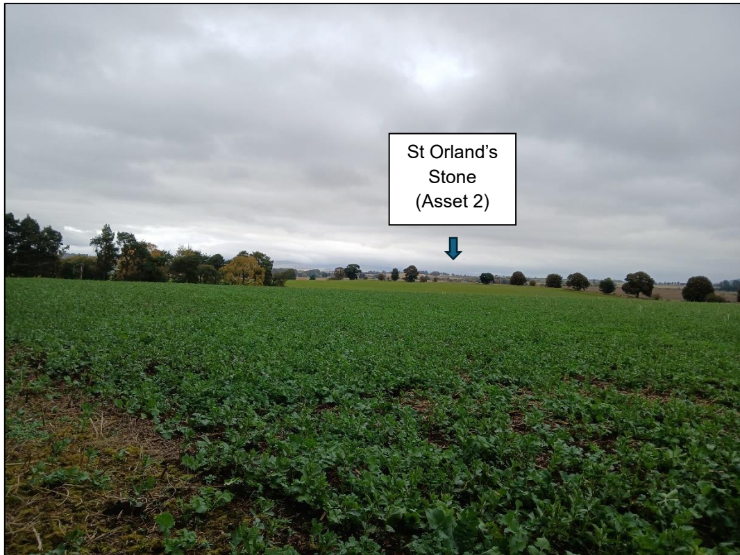
Plate 29: Northeast facing view from westernmost edge of the Land Parcel 1