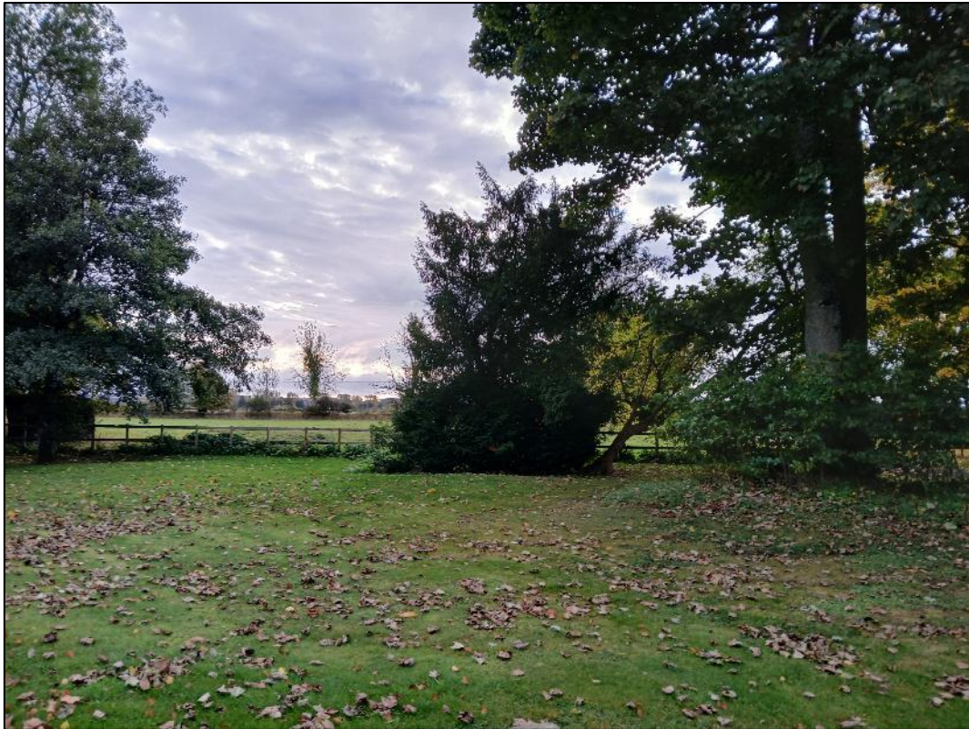
Plate 17: South facing view from outside Ballindarg House (Asset 42) looking towards the Site