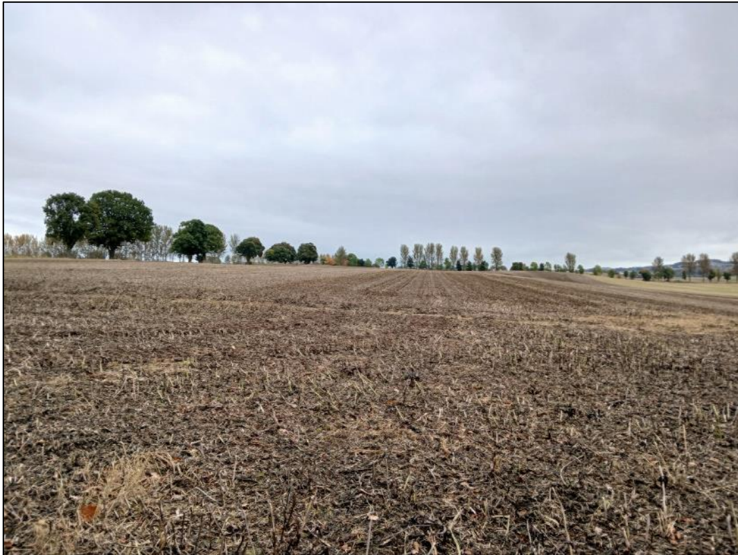
Plate 7: East facing view of the western field in Land Parcel 2