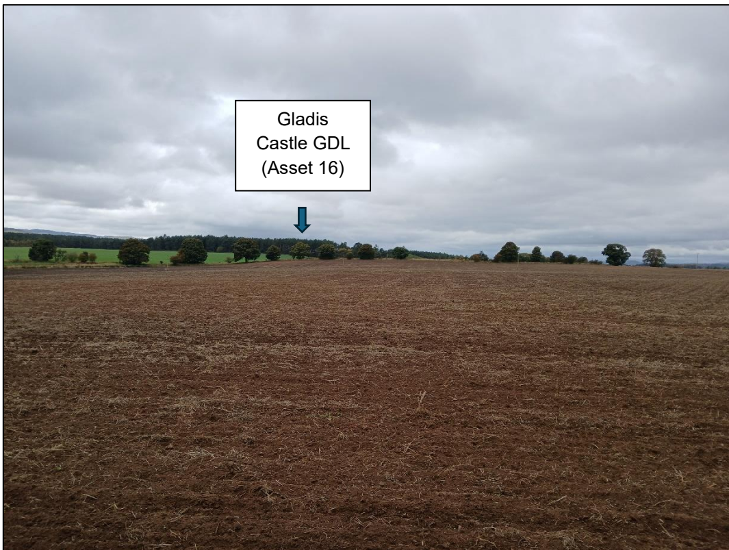
Plate 28: East-north-east facing view from St Orland's Stone (Asset 2)