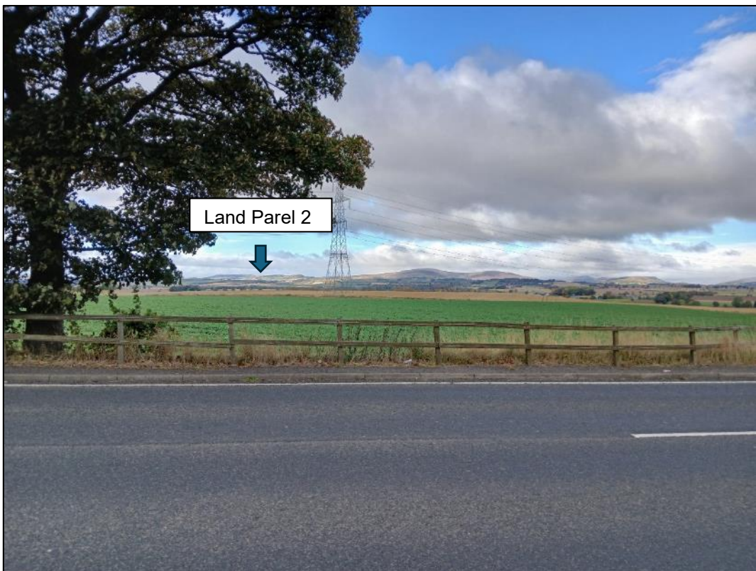
Plate 22: Northwest facing view from Mains of Brighton Enclosure 500m N of Mains of Brighton (Asset 6)