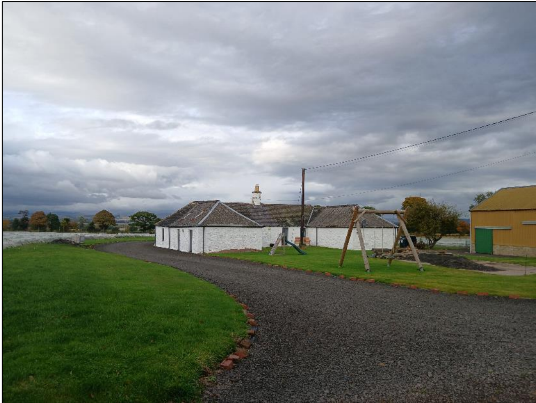
Plate 27: North-north-east facing view of 2 Plans of Thorton (Assets 154-156)