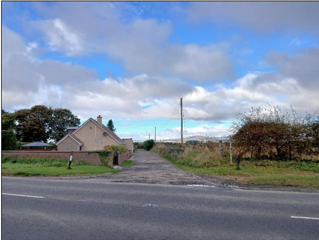
Plate 25: Northwest facing view from the road to the south of Douglastown House (Asset 108)