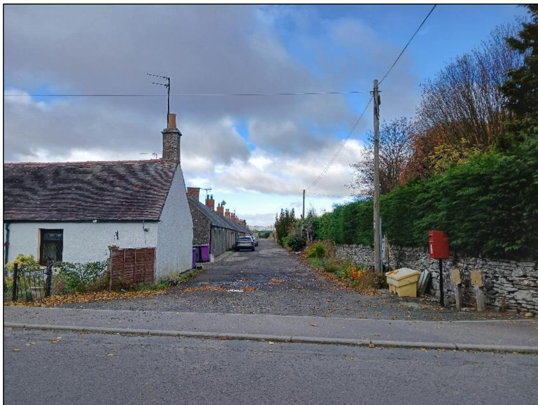
Plate 24: North-northwest facing view looking towards the Site from outside 7-9 Douglastown (Asset 122)