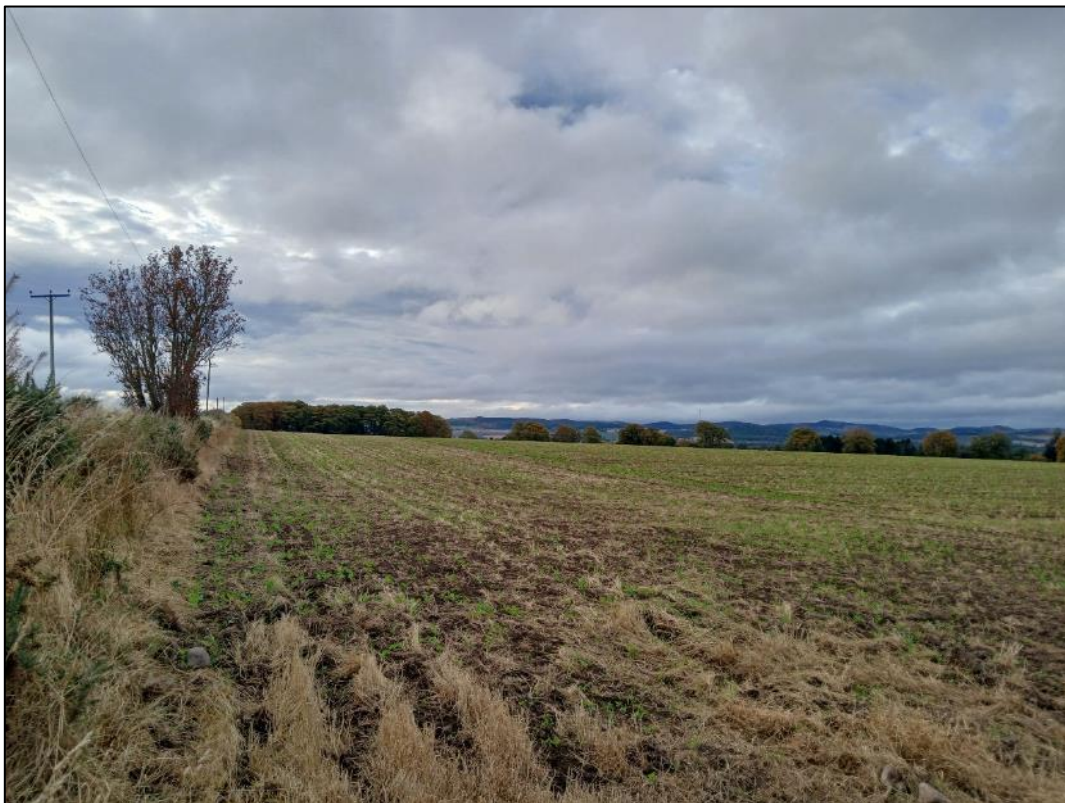
Plate 20: South facing view towards the Site from a road to the west of Fletcherfield, two standing stones, Fletcherfield (Asset 13)