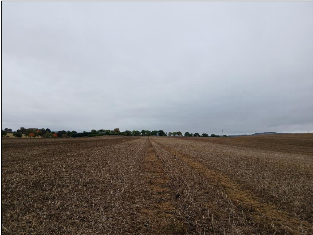
Plate 13: East facing view of the eastern field of Land Parcel 2