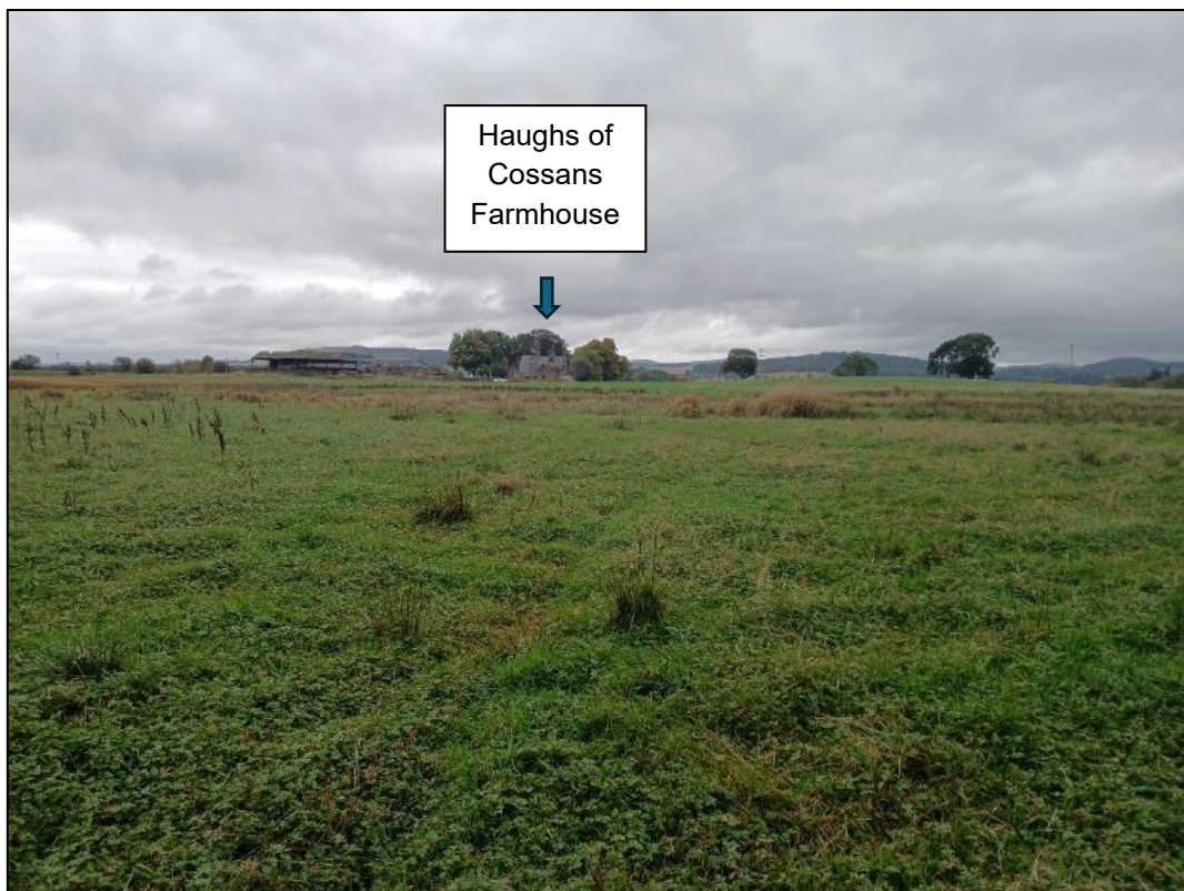
Plate 2: South facing view of the eastern field of Land Parcel 1 showing Haughs of Cossans Farmstead (Asset 148)