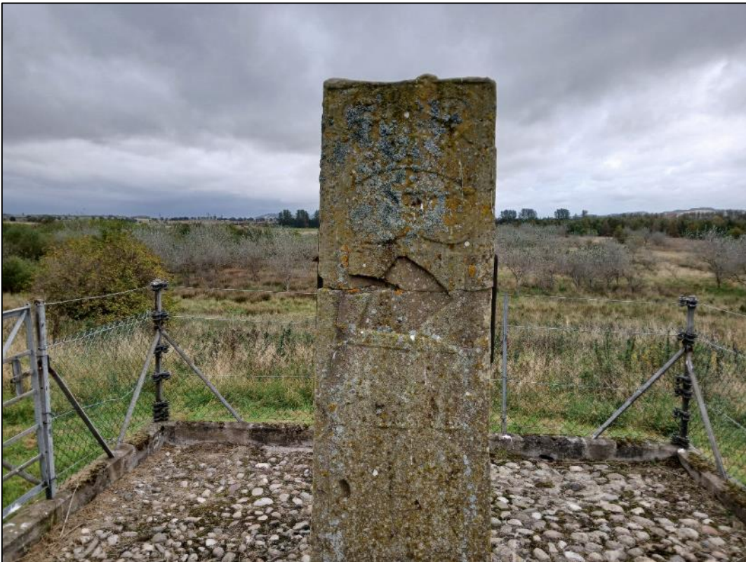
Plate 14: East facing view of St Orland's Stone (Asset 2)